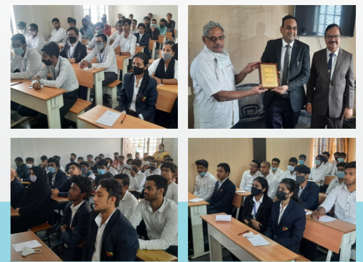
Career Development Programme