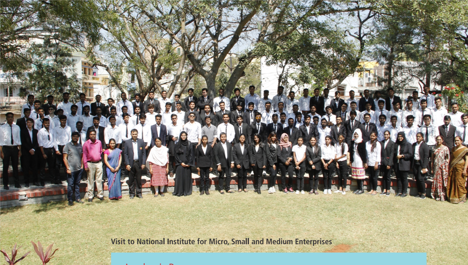
Visit to National Institute for Micro, Small and Medium Enterprises