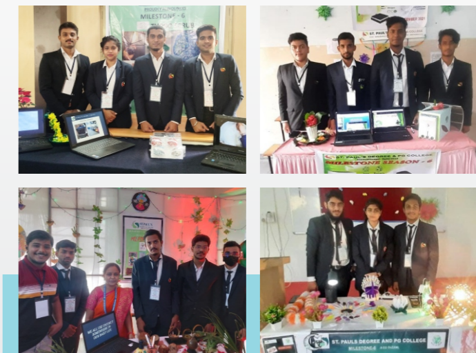
Milestone 6 - Presentation of Eco-Friendly Business Plans