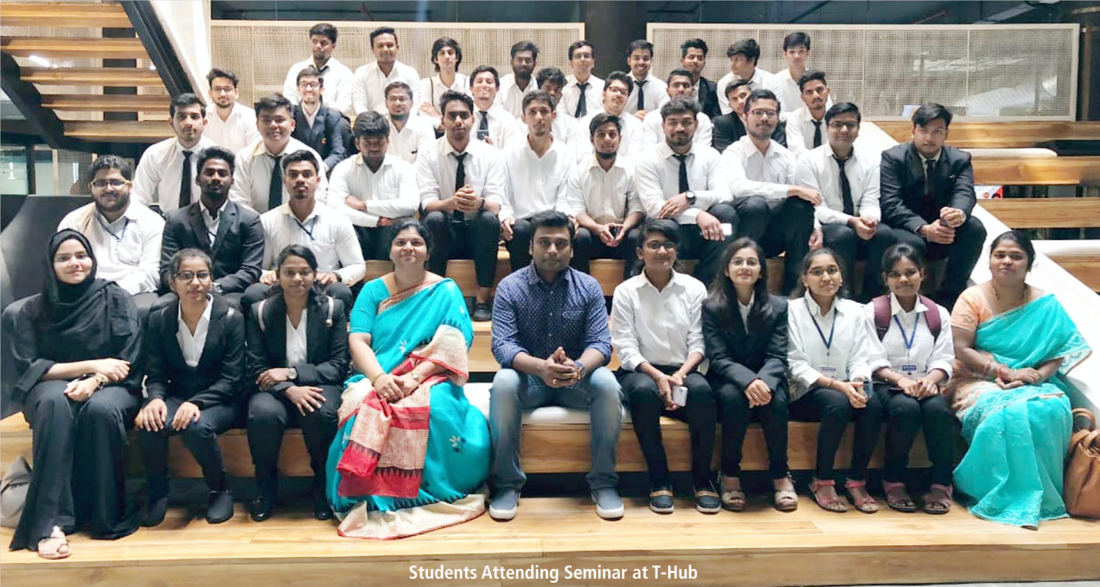
Students Attending Seminar at T-Hub