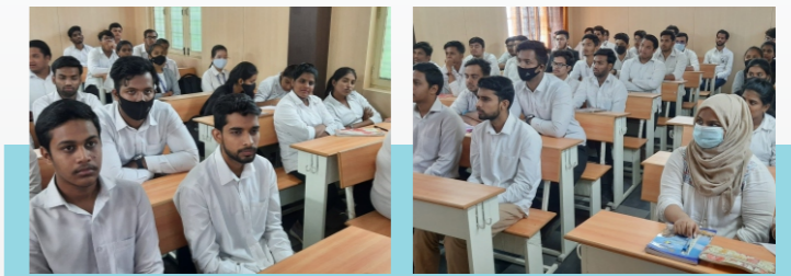
Webinar by Bombay Stock Exchange.