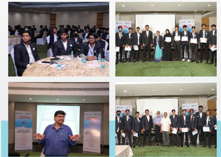
Entrepreneurship Development Programme conducted at Marriott HOTEL