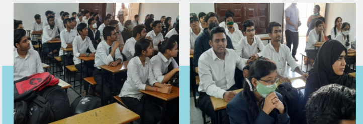
Seminar on Digital Marketing.